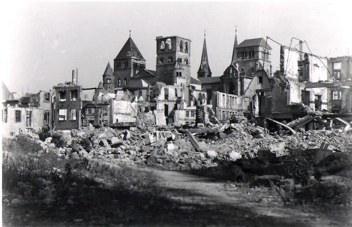
View from Grabenstrasse to the cathedral and the Church of Our Lady.

In 1945, an American military chaplain in Trier collects broken glass from the church of our Lady. Decades later, the fragments are turned into a work of art that reminds us of peace. It can be seen high above the Golden Gate Bridge in San Francisco.