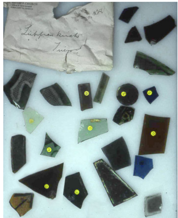
The shards from the Trier Liebfrauenkirche.